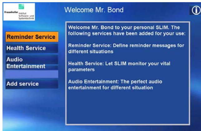
Fig 1: Available AAL services in the SLIM

The initial set of context adaptive services for Mr. Bond includes a reminder service, a health service and an audio entertainment service. The services are available in Mr. Bond's Smart Living Manager (SLIM), which he can access using a mobile or stationary device, e.g. his television.